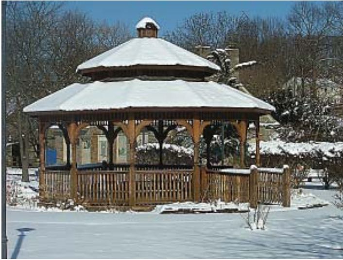
The Gazebo at Merry Place

Merry Place is a park area designed and built by volunteer contributions for people of all ages and abilities, especially families of children with special needs. You and your family are welcome to help out at Merry Place. Bring your shovel, rake, clippers or just a helping spirit and join other community volunteers at Merry Place on Saturday, May 8th.