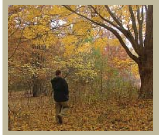
Research shows time spent with nature relieves stress and improves health.