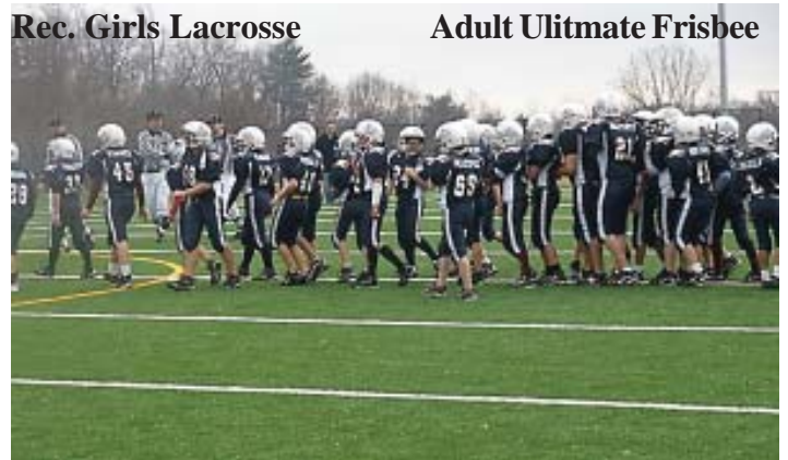
St. Denis takes the field on Thanksgiving Day.