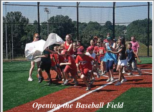
Opening the Baseball Field