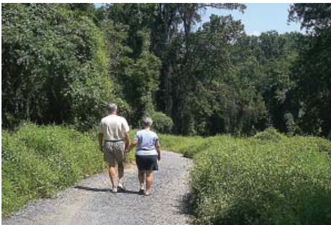
Research shows trails increase walking especially in those people over age 50.

The South Brook and Meadow Trail are open for your enjoyment. Enjoy the feel of a peaceful walk in the woods right here in Haverford Township.