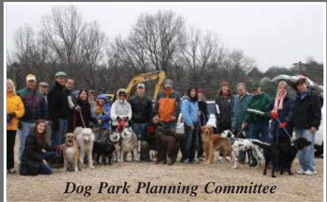
Dog Park Planning Committee