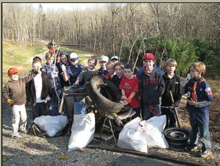
Cub Scouts from Coopertown and Lynnewood joined in the volunteer Trail Maintenance Day at Community Park in Haverford Reserve.

Our mission is to make living in Haverford Township more enjoyable and healthier for you, your family and friends by providing top quality recreation programs, facilities and service.