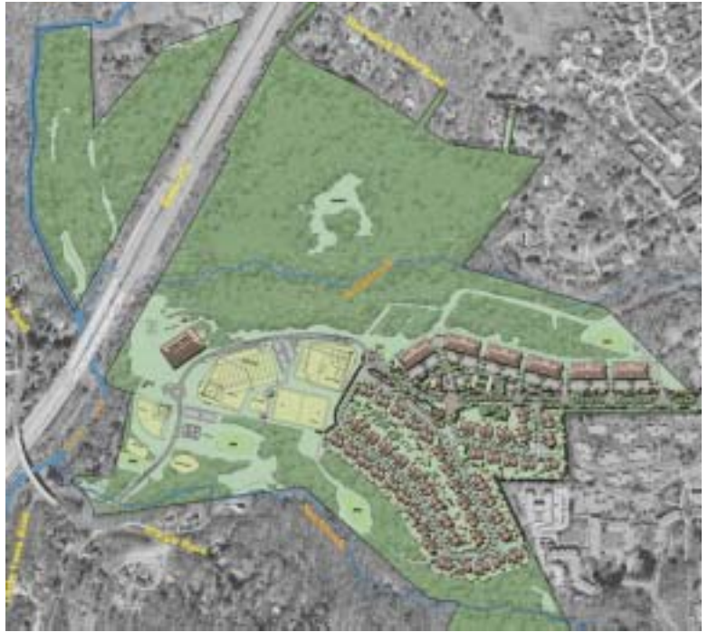
The Community Recreation area, open space, and private sector.

The current construction cost estimate for the indoor area is $8 - 10 million and the outdoor area is $3 million. In keeping with the resident's survey, the cost of the Recreation facilities could be funded with the $17.5 million the developer will pay the Township for the private sector.